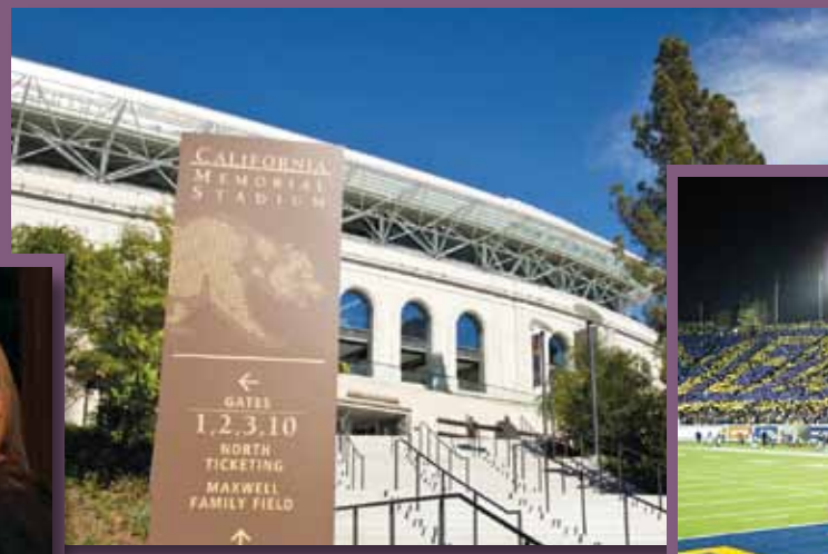
California Memorial Stadium opened its gates on September 1, 2012 after a 21-month renovation.

For more information, please visit alumni.berkeley.edu/chartergala .