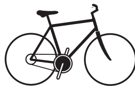
BIKE #1 (included in trip price) • Backroads Custom Ti Touring • Upright handlebars • Fits riders 4'11" to 6'4"