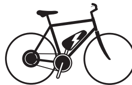
BIKE #2 ($300 rental fee)* • Backroads Custom Ti eBike • Upright handlebars • Fits riders 4'11" to 6'4"

For model availability please see our bike fleet page at www.backroads.com/why/great_gear .