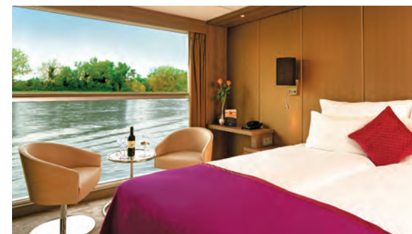
Left: MS Amadeus Silver II Above: MS Amadeus Silver II cabin