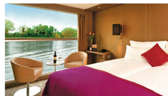
Left: MS Amadeus Silver II Above: MS Amadeus Silver II cabin