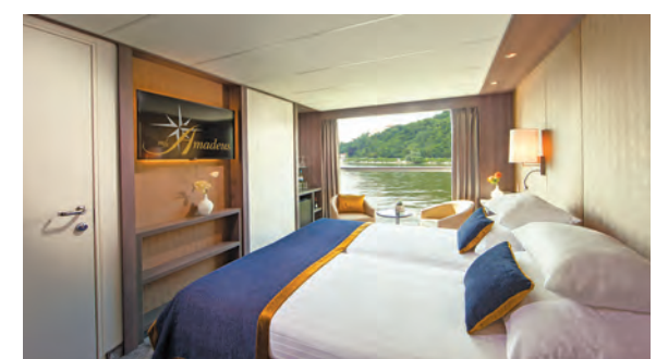
Left: MS Amadeus Silver III Above: MS Amadeus Silver III cabin