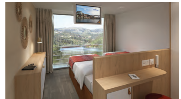
Left: MS Amalia Rodrigues Above: MS Amalia Rodrigues cabin